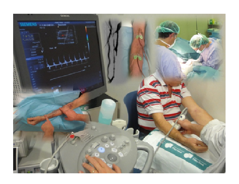
April 5-6, 2016 Sabadell, Barcelona